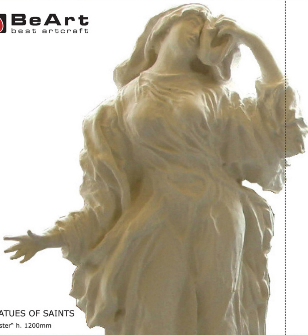
_STATUES OF SAINTS „plaster“ h. 1200mm

Sculpture pastiche were put into film scenery in Myloslavovo, Bratislava